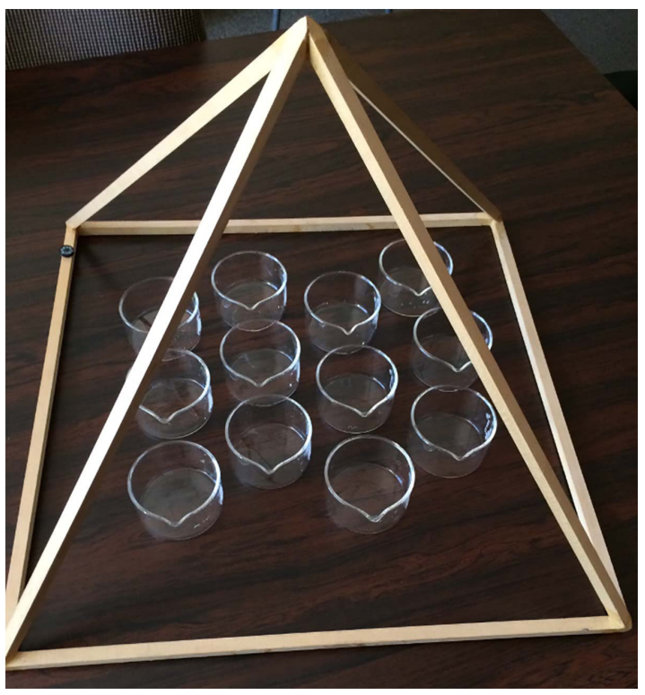
Figure 4. Pyramidal structure oriented to geomagnetic north placed over test samples.