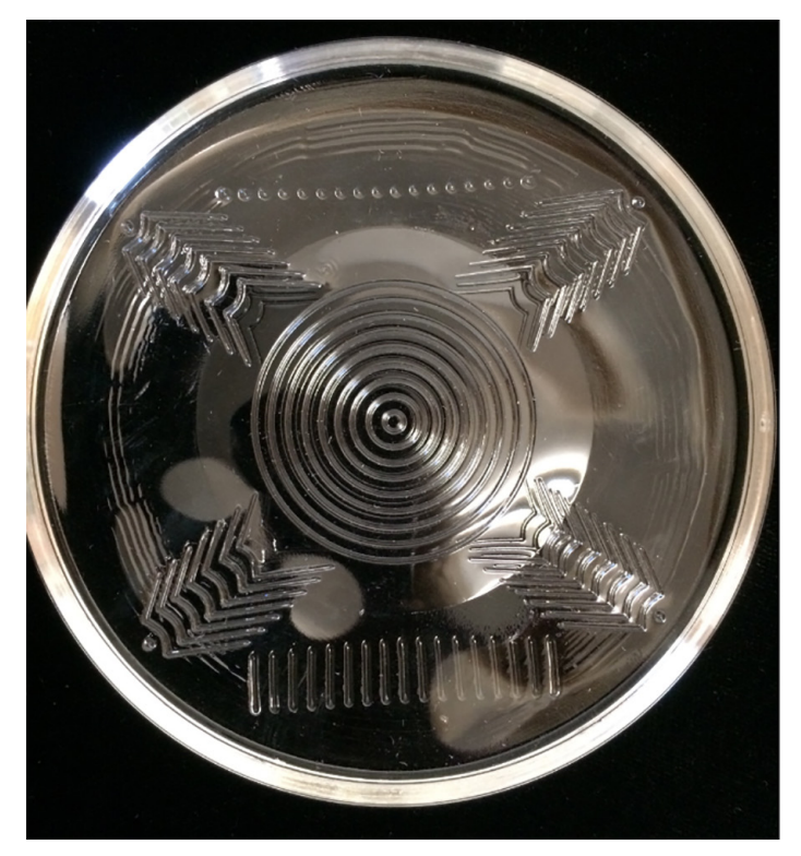
Figure 2. Amezcua BioDisc-3 showing the geometrical relief patterns of dots, parallel lines, concentric circles, and other patterns.