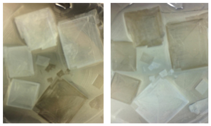
Figure 6. Sodium chlorate crystals viewed under polarized light with rotation of the analyzer in opposite directions to show the two chiral forms; (a), analyzer rotated to the right; (b) analyzer rotated to the left.

In addition, there were some noteworthy qualitative changes in the treated samples. It was found that a smaller number of crystals formed in the BioDisc-3 treated