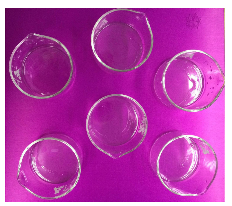
Figure 3. Purple Plate treatment of test samples during crystallization.

and was developed in the 1970s by Ralph Bergstresser, who claimed to have been an associate of Tesla. The device is said to "energize" water, among other effects, and can produce changes in the taste of food and drink (Web Ref. 3). No published studies on this product were found. A 12 x 12-inch Purple Plate was placed under the test crystallization dishes. See Figure 3 .