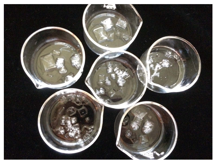
Figure 5. Typical results of sodium chlorate crystallization in six samples viewed under ordinary light.

Paired t-tests were calculated to compare the number of l -crystals and d -crystals for the pooled data from control